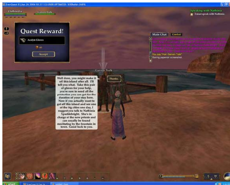
Figure 3. Screenshot of the EverQuest II game

In relation to using a games-based approach to teaching languages Rankin et al., (2006) in a preliminary study used EverQuest II to support the teaching of English language as a second language. A screenshot from EverQuest II is shown in Figure 3. EverQuest II is an example of a Massive Multiplayer Online Role Playing Game (MMORPG) that was found to be useful in generally reinforcing language acquisition. MMORPGs generally create a persistent universe in which hundreds of thousands of players can simultaneously interact in graphically rendered immersive worlds. By completing the quests, Rankin et al., (2006) found that the small number of players used for the purposes of their study who comprised Korean, Chinese and Castilian speakers were able to gain an appreciation for colloquial meanings, verbs and adverbs.