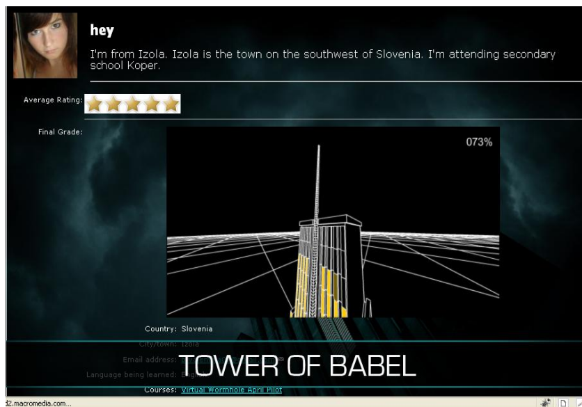
Figure 4. Example of the 'Tower of Babel' interface

solving skills (48.8%), reflection skills (37.7%), analysing and classifying skills (44%), collaborative and teamwork skills (55%), leading and motivating skills (41%), critical thinking skills (32%), and creativity skills (54%). 92% of the students who completed the evaluation questionnaire indicated that they felt there should be more use of ICT in language learning. Of nineteen language teachers who completed a post-test evaluation questionnaire 42% considered that using the ARG to be a very valuable professional experience. Some of the issues raised by the teachers included some technical problems in using the ARG, as well as some teachers (5%) considering that it might be too difficult to monitor students' actions throughout the game. In addition, for teachers participating in the ARG, it did put immense pressure on markers to ensure that students received scores and feedback in a timely manner once they had conducted a quest so that they could continue onto the next quest.