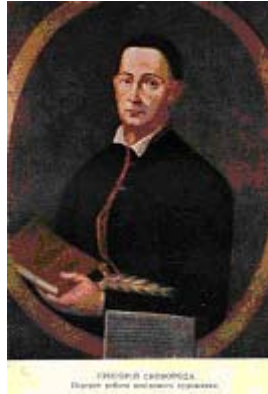
Figure 1. Grigorij Skovoroda, Ukraine

For the Power Point condition, the same 9 pictures were used, the presentation being as for the VE condition but using successive PowerPoint slides, images separated by blank screens. In the control text condition, the pictures were printed on A4 sized sheets and presented to the child in landscape orientation with text added as in other conditions.